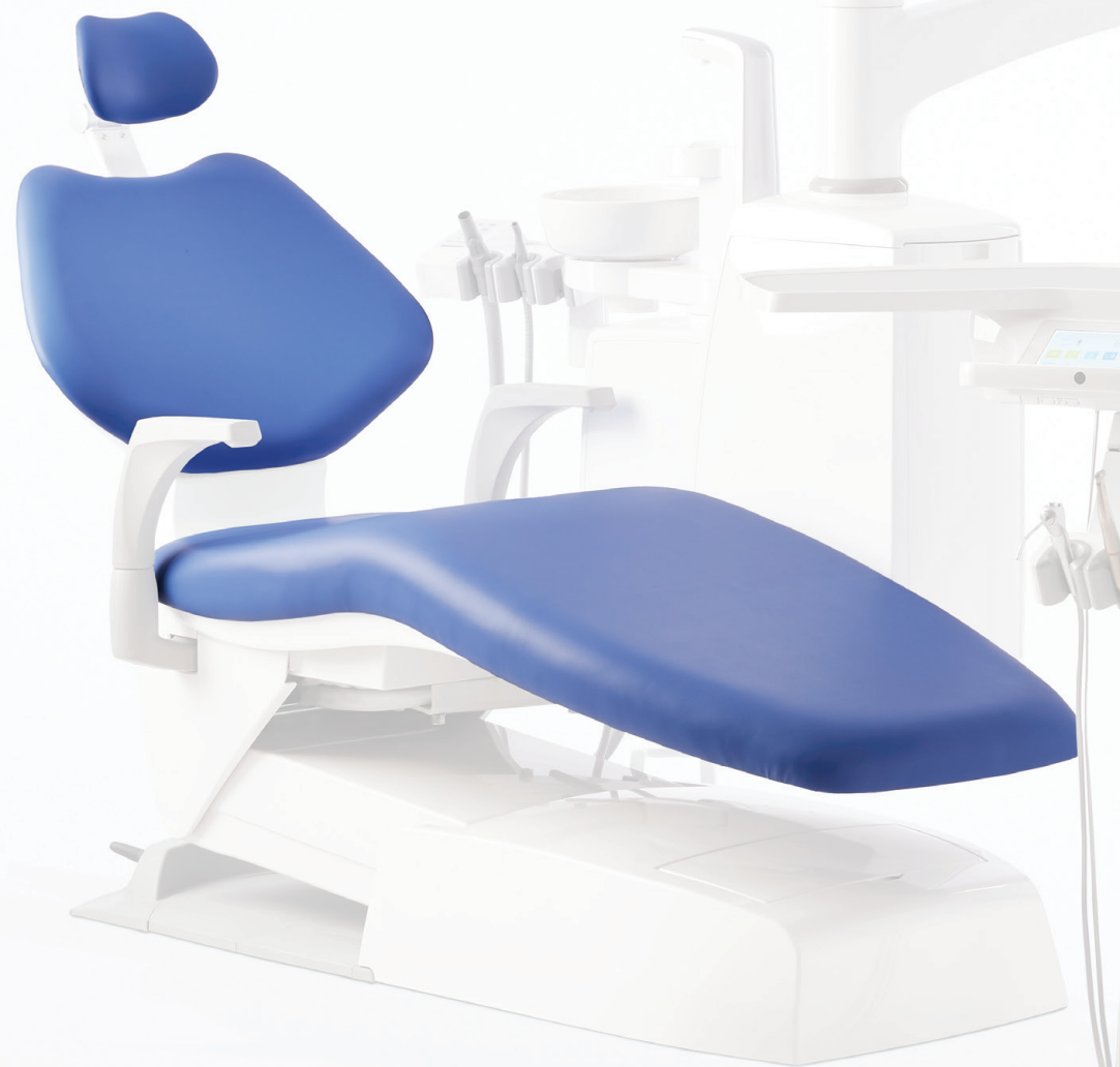
Eurus S1 Chair shown with Seamless Upholstery