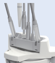
New Flushing Tray - suitable for all treatment centres

* Additional micro motors must be the same model as the primary micro motor.