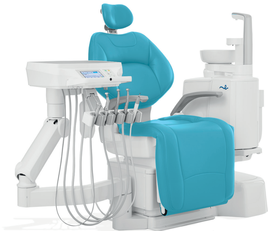
Eurus S6 shown with Luxury Upholstery