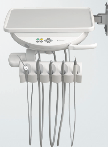
Module Delivery System