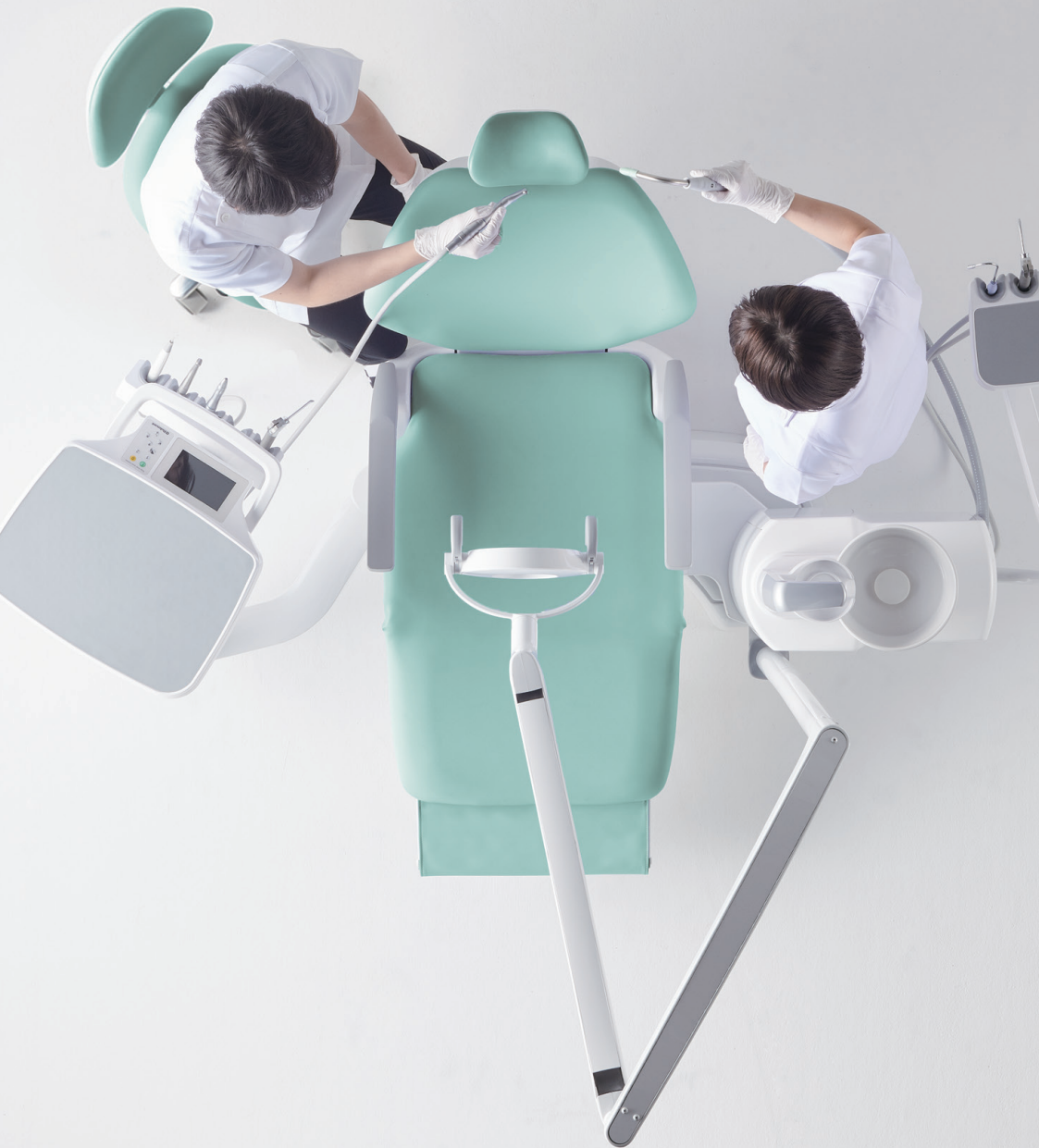
Eurus S6 enables greater workflow freedom