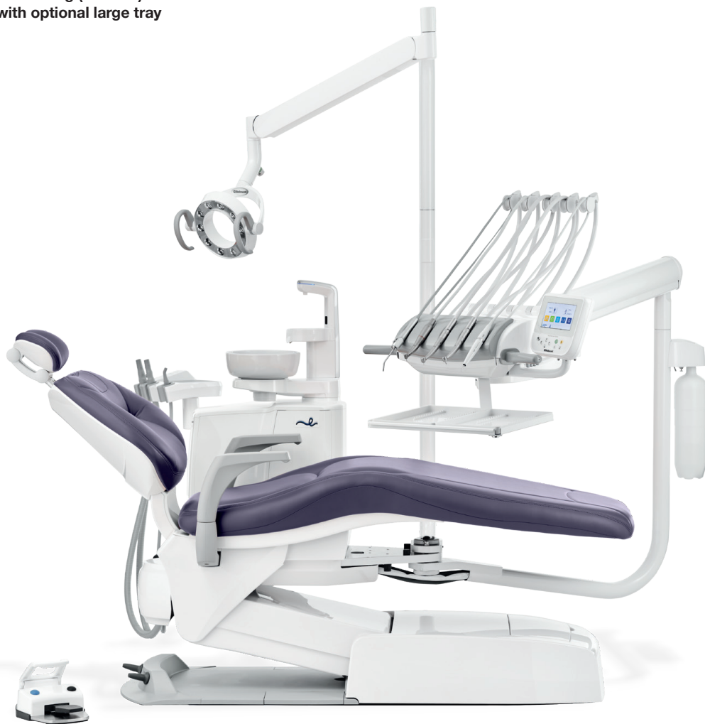
Eurus S8 shown with Luxury Upholstery

Chair mounted under patient ambidextrous Rod Swing (A and E) Treatment Centre shown with optional large tray