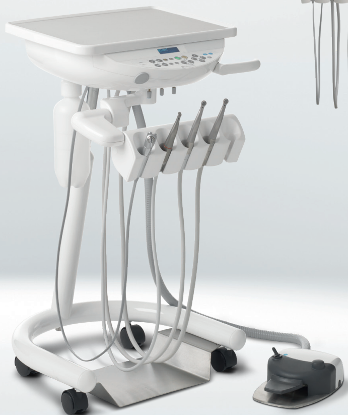
Mobile Cart Delivery System