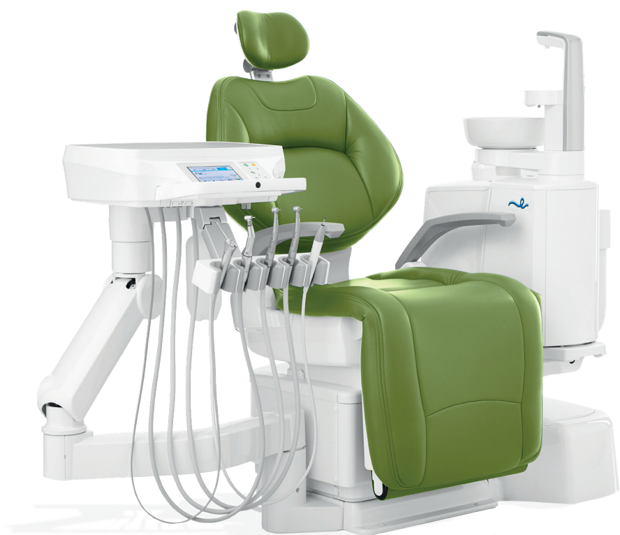
Eurus S6 shown with Luxury Upholstery