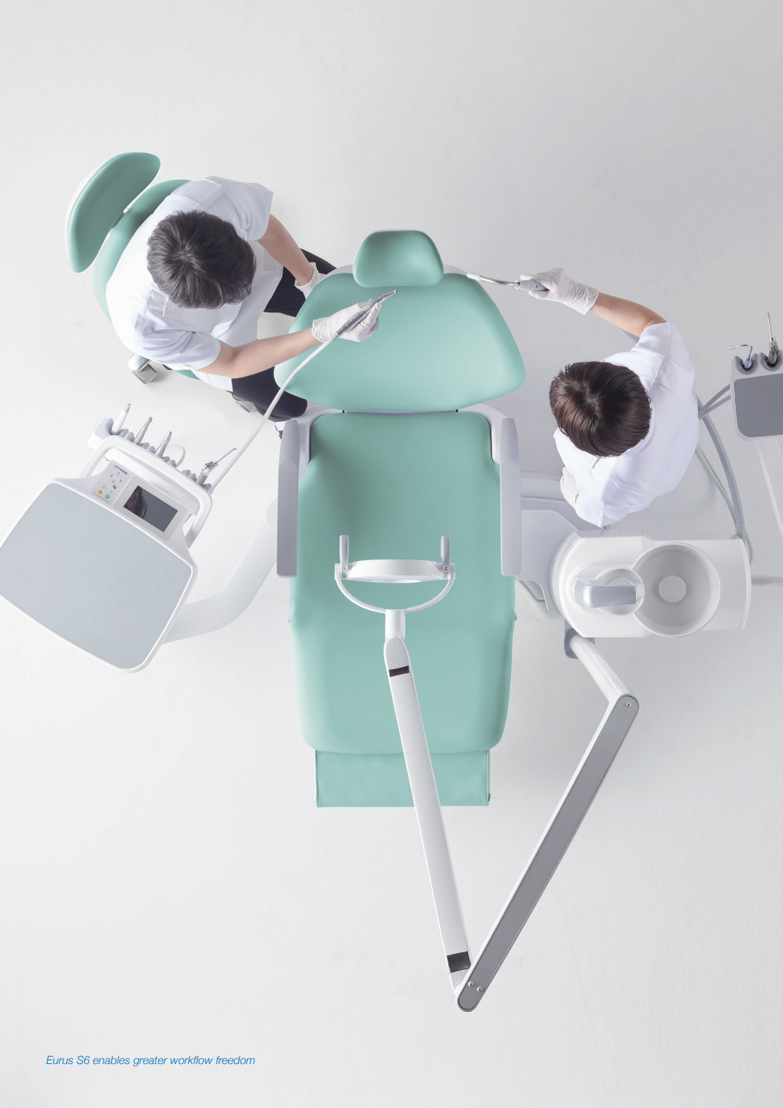
Eurus S6 enables greater workflow freedom