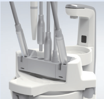
New Flushing Tray - suitable for all treatment centres

* Additional micro motors must be the same model as the primary micro motor.