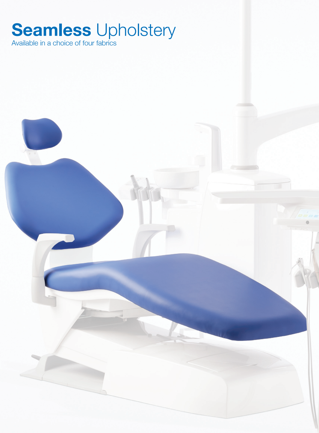
Eurus S1 Chair shown with Seamless Upholstery