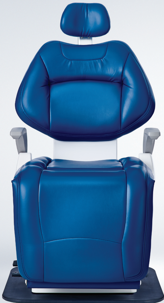
Eurus Swivel Chair shown with Luxury Upholstery