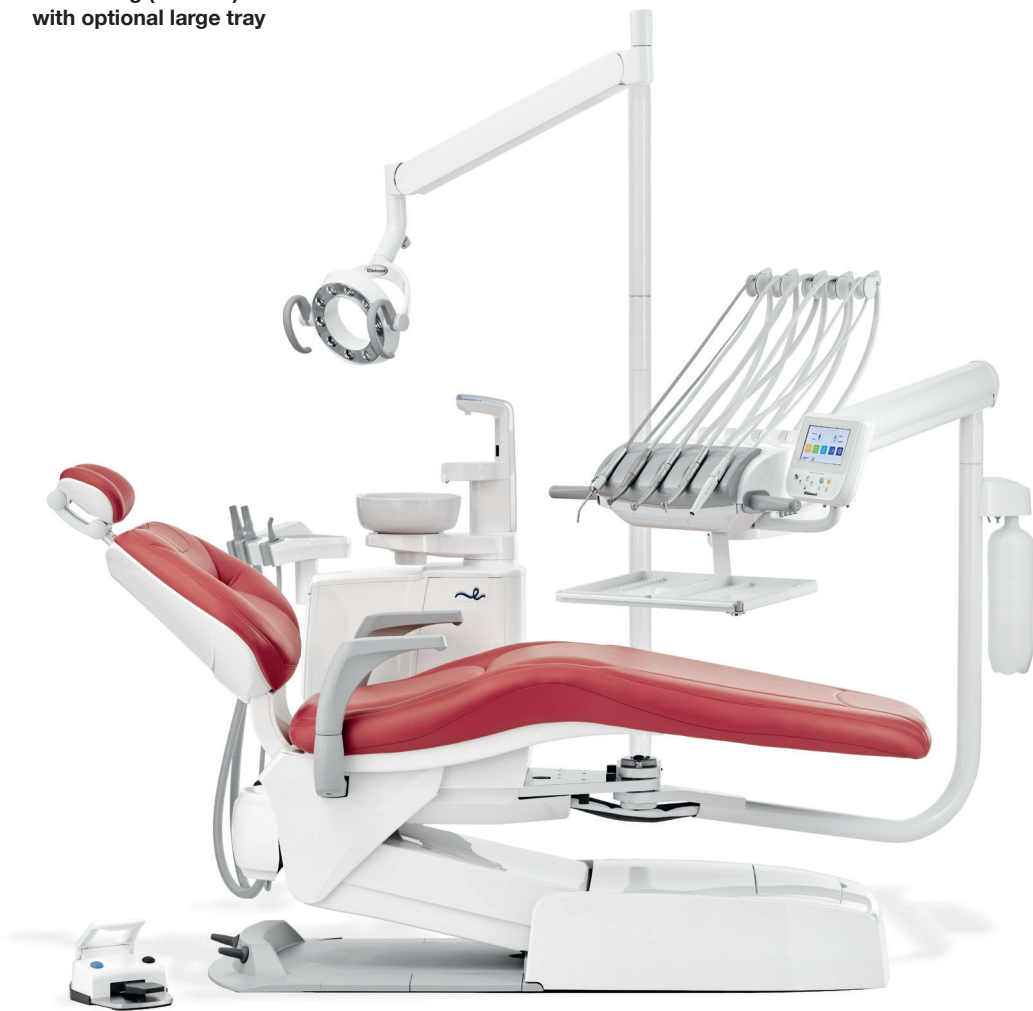
Eurus S8 shown with Luxury Upholstery

Chair mounted under patient ambidextrous Rod Swing (A and E) Treatment Centre shown with optional large tray