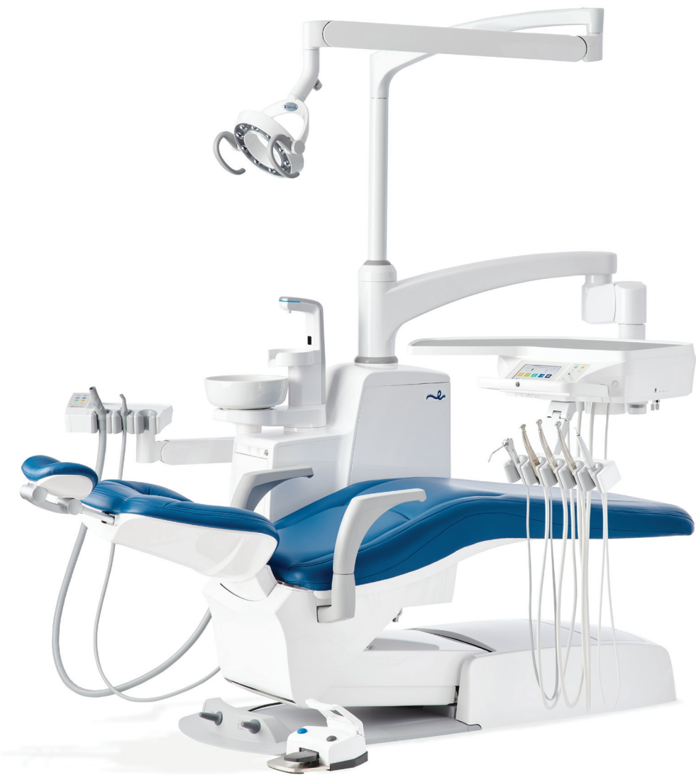
Eurus S1 shown with Luxury Upholstery