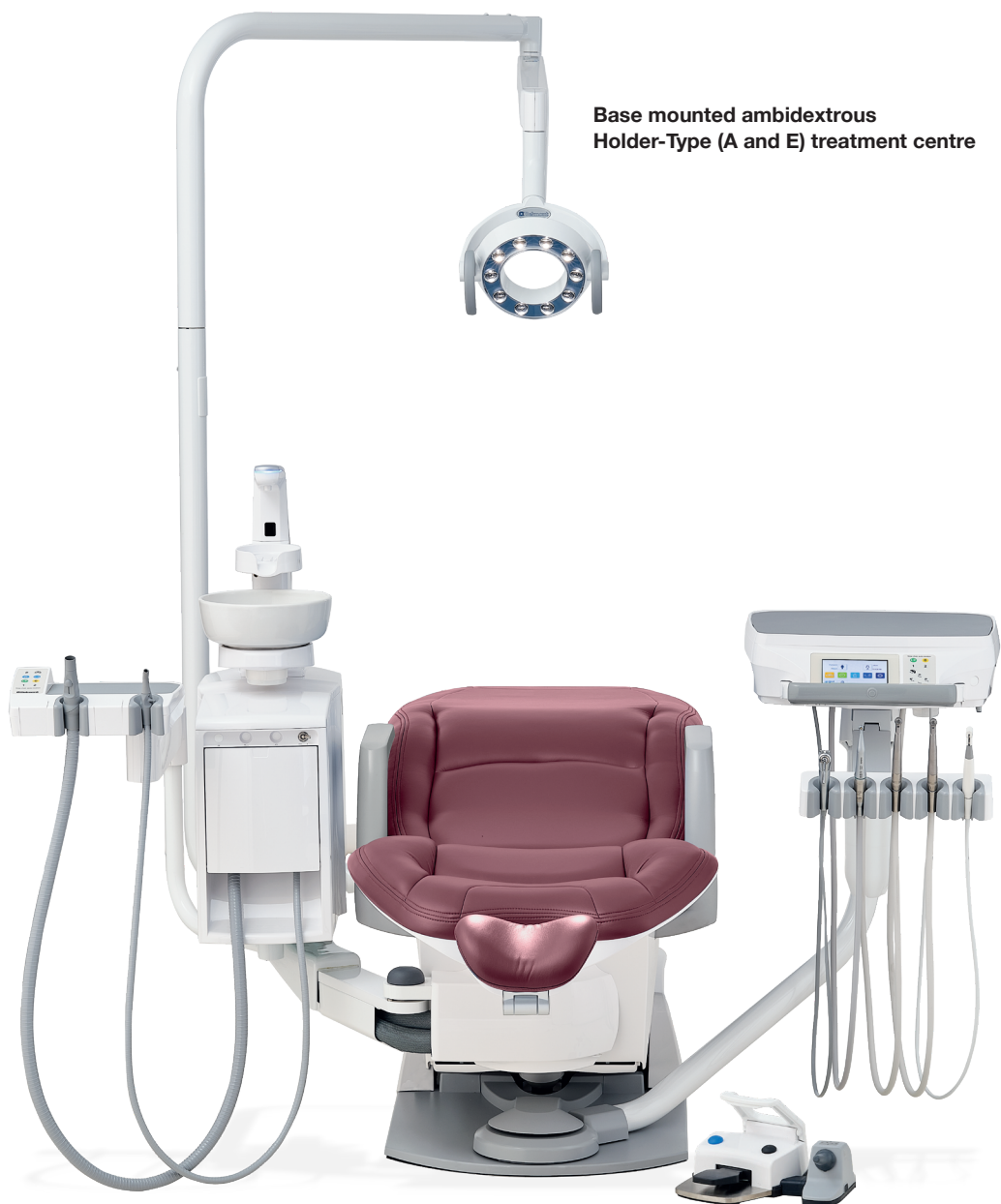
Base mounted ambidextrous Holder-Type (A and E) treatment centre