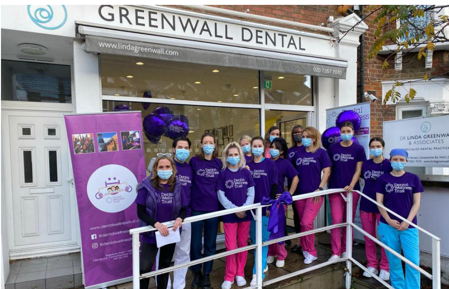
The amazing volunteers who help treat the child refugees to provide free dental care