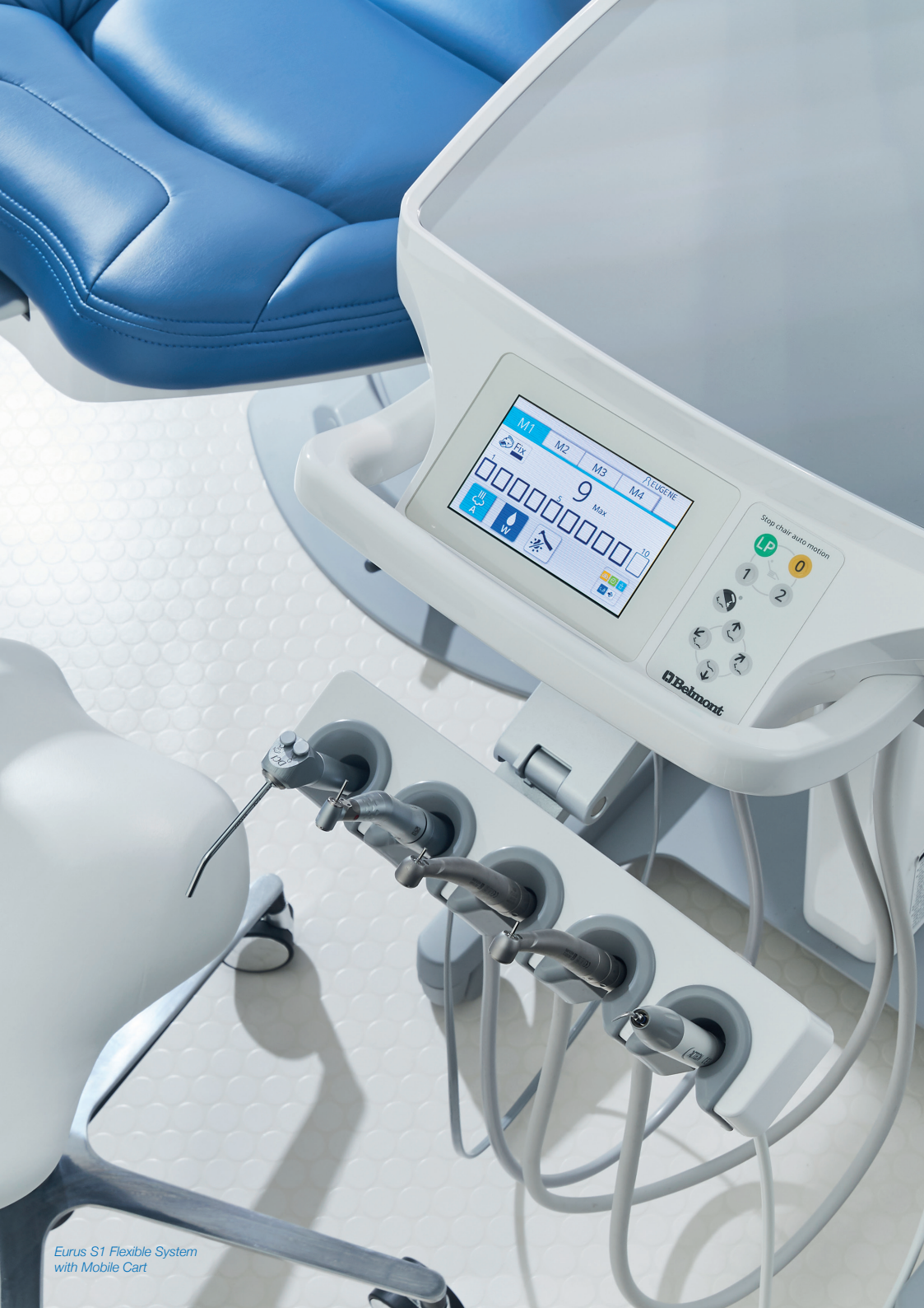
Eurus S1 Flexible System with Mobile Cart