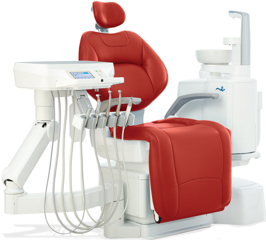
Eurus S6 shown with Luxury Upholstery